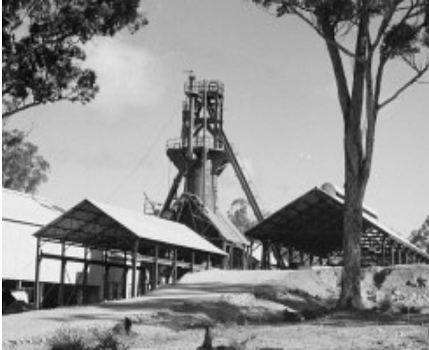
Wundowie Saw Mill 1947