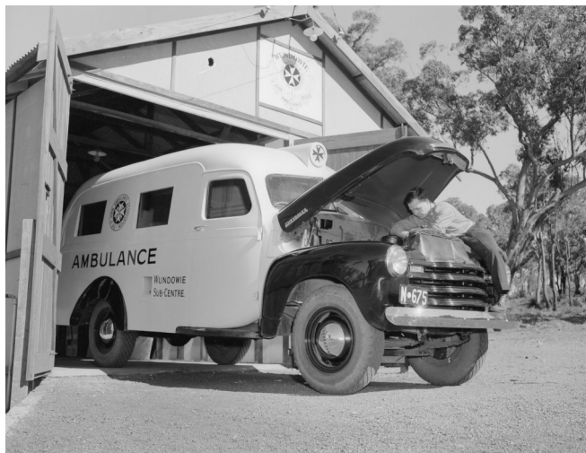
Wundowie Ambulance 1946