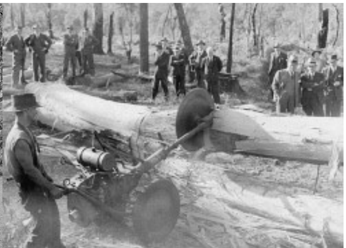
Large Motorised Saw