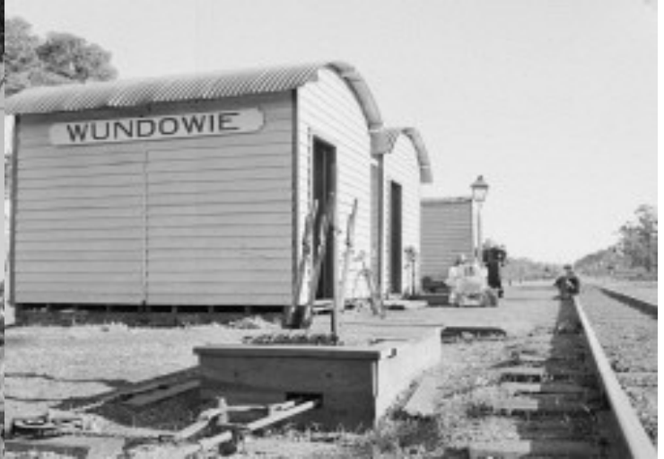
Wundowie Railway siding 1946